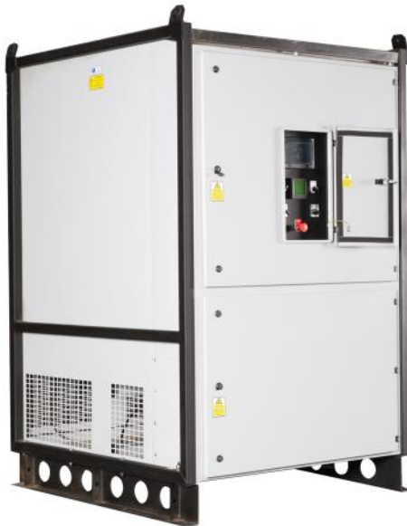
300KW Load Bank