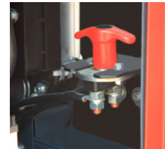
Battery Isolator Switch