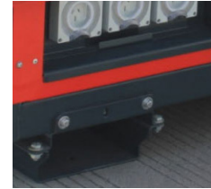
Heavy Duty Forklift Pockets