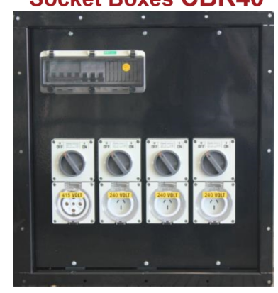
Socket type 3 x 15A 2P + T 1 x 32A 3P + N + T